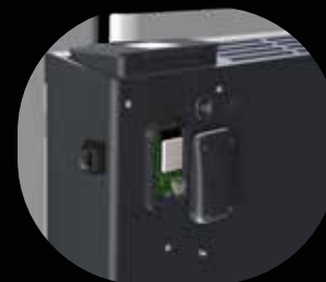
RADIALIGHT WiFi MODULE Ean Code 8019250955116

Get complete instructions on the radialight.com website.